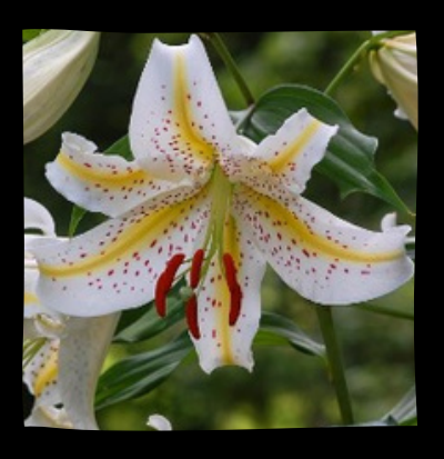
GARDEN PARTY Ht: 16"-18"" $7