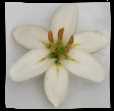
FLAT WHITE STAR Ht: 2'-4' $15