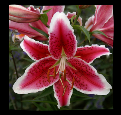
STARFIGHTER $7 Ht: 3'