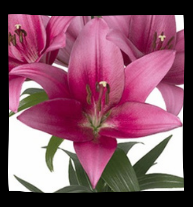
LYCOS Ht: 3'-4'