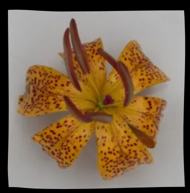
ARTIC LEOPARD Ht: 2'-4" $30