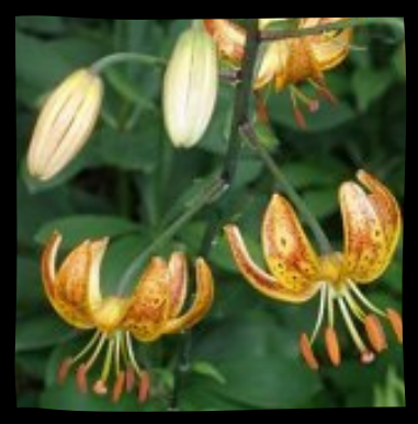
ASPEN GOLD Ht: 4' $28