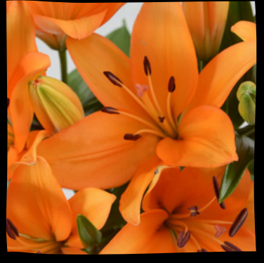
CASESARS PALACE Ht 47" $6