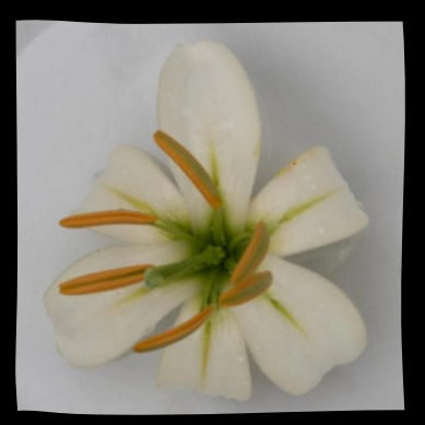
CECILIA BERTRAM _____Ht: 2'-4' $20