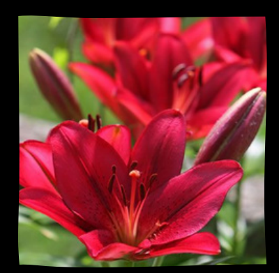
FANGIO Ht: 4'-6' $6