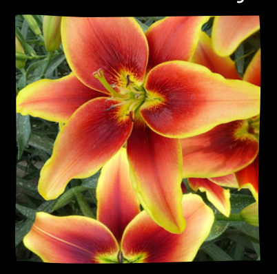
AVALON SUNSET Ht: 3.5' $7

Cross between an asiatic and oriental lily and again with an asiatic lily.