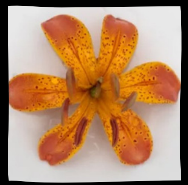
JAFFA JUBILEE Ht: 2'-4' $20