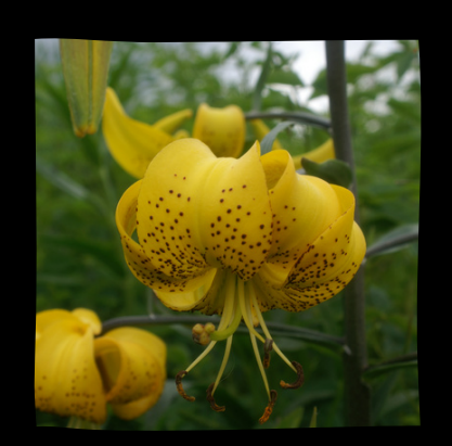
CITRONELLA Ht: 3'-4' $6