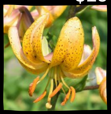
SLATE SEEDLING Ht: 3'-4'$28