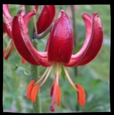
RED MAN Ht: 3'-4' $28