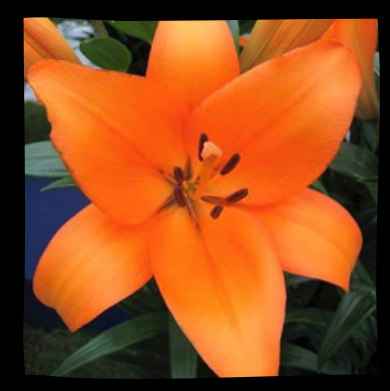
HERENICA Ht: 3'-5' $6