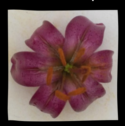
CERISE Ht: 2'-4' $20