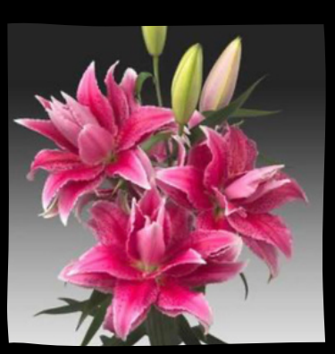
THALITA Hy: 36"-40"