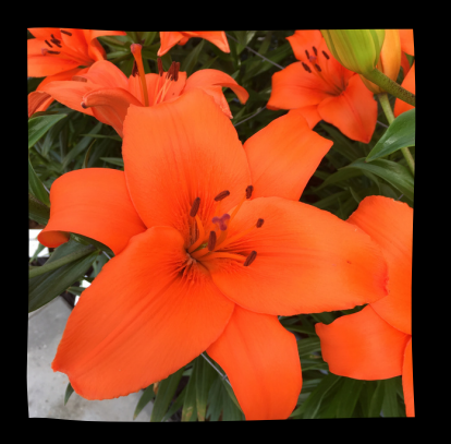
BRUNELLO Ht: 35" $6