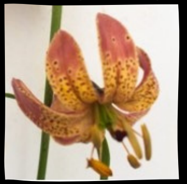
ST PAUL Ht: 2'-4' $20