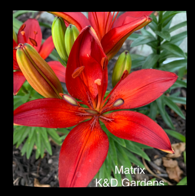
MATRIX Ht: 12"-14" $6