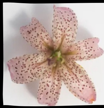
SHERWOOD PARK $25