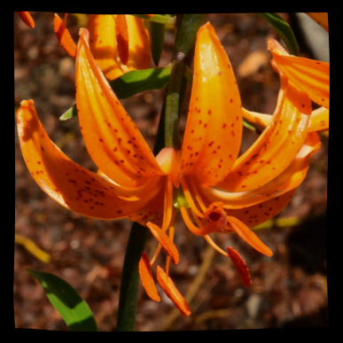
BRUNSWIEK Ht: 4'-5' $28