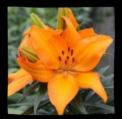
LAVA JOY Ht: 16"-18" $6