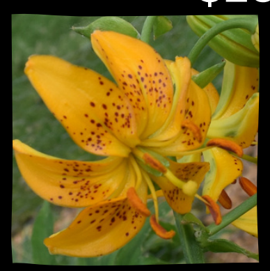
l. HANSONII Ht: 3'-4 $28