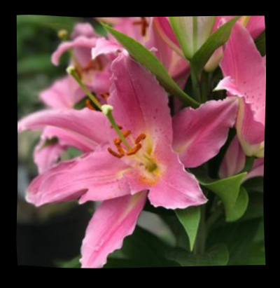
SUNNY CAMINO $7