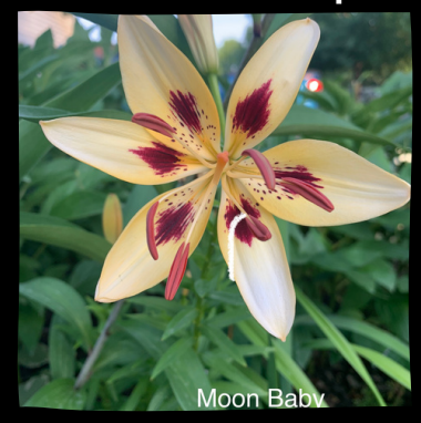
MOON BABY Ht: 36" $6