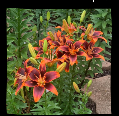
FOREVER SUSAN Ht: 36" $6