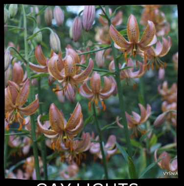
GAY LIGHTS Ht: 3'-4' $24