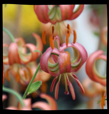
ROSE ARCH Ht: 3' $15