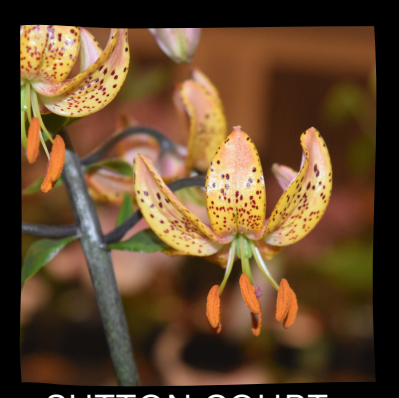
SUTTON COURT Ht: 4' $15