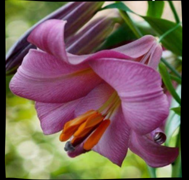
PINK PERFECTION Ht: 40 '-50 ' $7