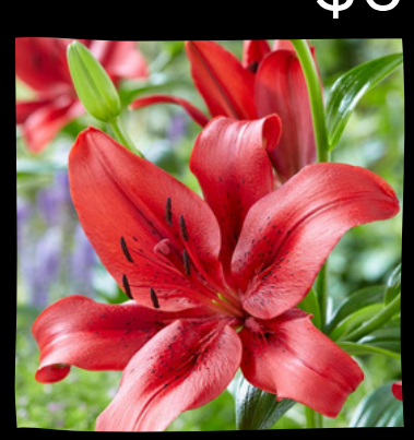
ORIGINAL LOVE Ht: 47" $6