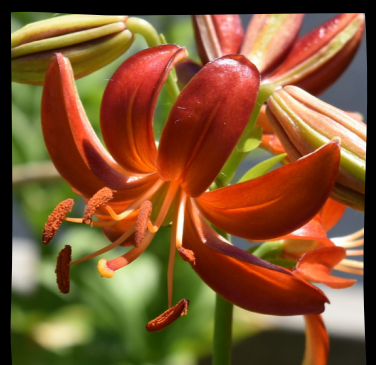
Hantsing Ht: 3'-5' $28