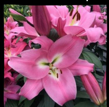
TABLE DANCE Ht: 41" $7