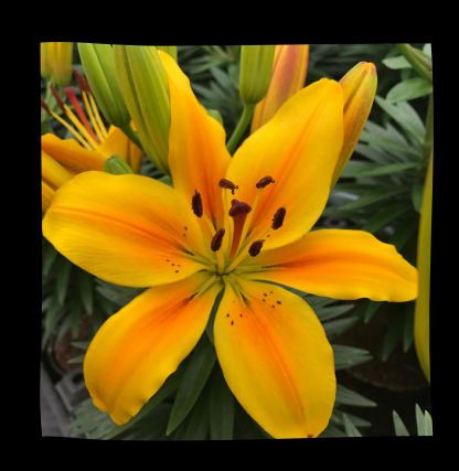
GOLDEN JOY Ht: 16"-18" $6