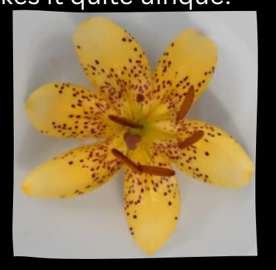
ALICIA BOYD Ht: 2'-4' $20