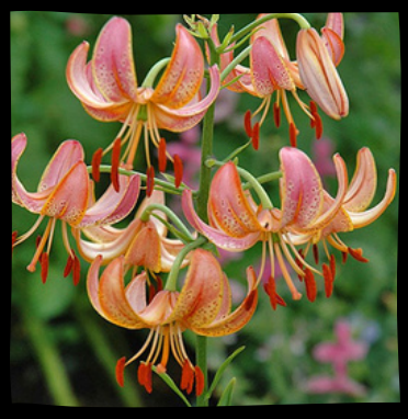
ATTIWAW Ht: 3' $28