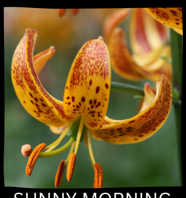
SUNNY MORNING Ht: 4'+ $15