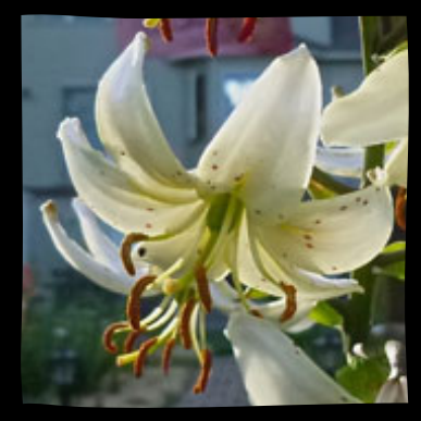
STARGATE Ht: 3'-4' $30