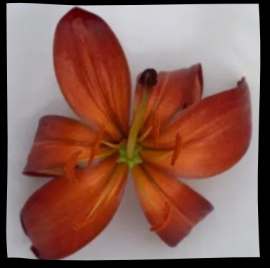
KEVA Ht: 2'-4' $25