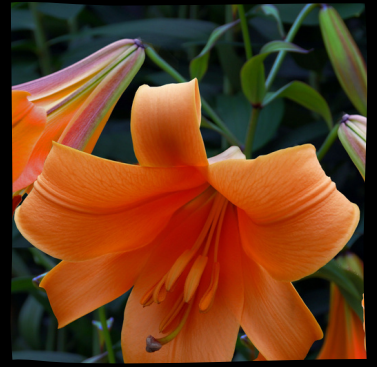
AFRICAN QUEEN Ht: 50"-60"