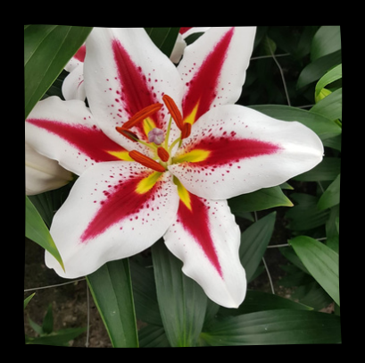
BIG SMILE Ht: 3'-4'