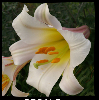
REGALE Ht: 40"-50" $7