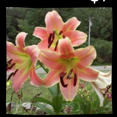
ZELMIRA $7 Ht: 3'-4'