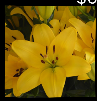
PAVIA Ht: 3.5'-4.5' $6