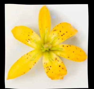
GOLD TOWER Ht: 2'-4' $15