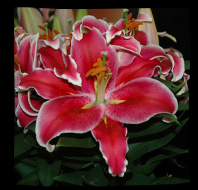
AFTER EIGHT Ht: 16"-20" $7