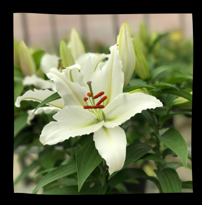
CASA BLANCA Ht: 3'-4' $ 7