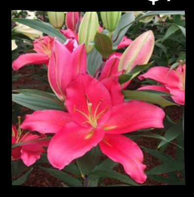
TARRANGO Ht: 3'-4' $7