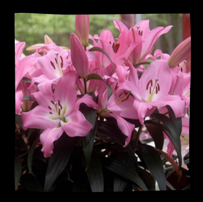
ALBULFEIRA Ht: 4' $6