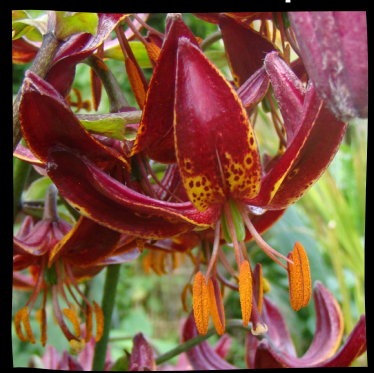
CLAUDE SHRIDE 4'-6' $15