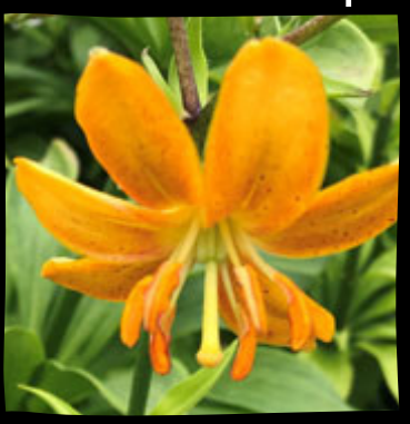
DUTCH HANSONII HYBRID Ht: 3'-4' $24