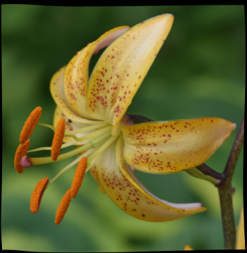
PAISLEY HYBRIDS Ht: 3'-5' $24