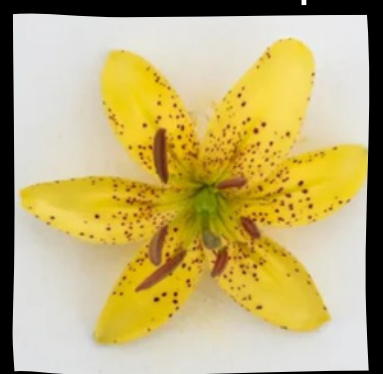
JOAN COLLINS Ht: 2'-4' $25