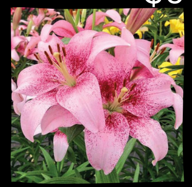
PINK BRUSH Ht: 3'4' $6