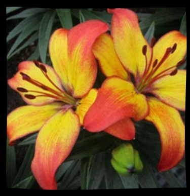
SUNSET JOY Ht: 16"-18" $6