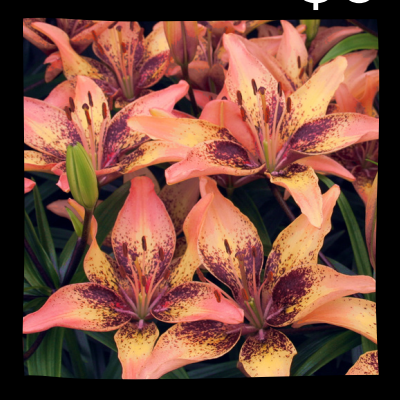
TRIBAL DANCE Ht: 3-"-36" $6