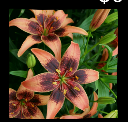
WHISTLER 24"-30" $6