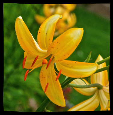
CADENSE Ht: 3'-4' $24