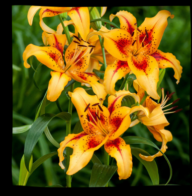
HOTEL CALAIFORNIA Ht: 42"-52" $7