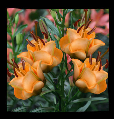
APRICOT FUDGE Ht: 2'-3' $6