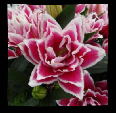
SAMANTHA Ht 32"-34" $7