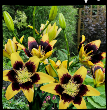
EASY DANCE Ht 25"-35" $6