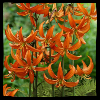
ORANGE MARMALADE Ht: 4'+ $20