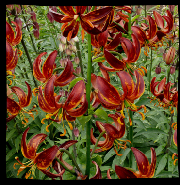
ARABIAN KNIGHT Ht: 36"-48" $24