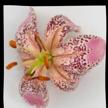
PINK OZELOT Ht: 2'4' $30