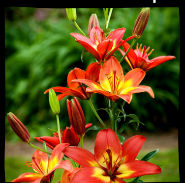
FOREVER LINDA Ht: 36 $6