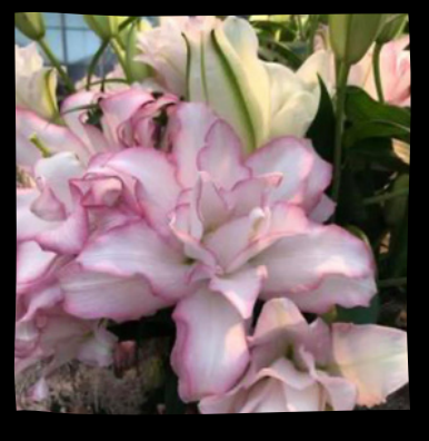
ANOUSKA Ht: 40"-48"