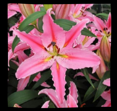
ROYALL PINK Ht: 3'-4'