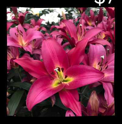
TOUCHSTONE Ht: 42"-52" $ 7