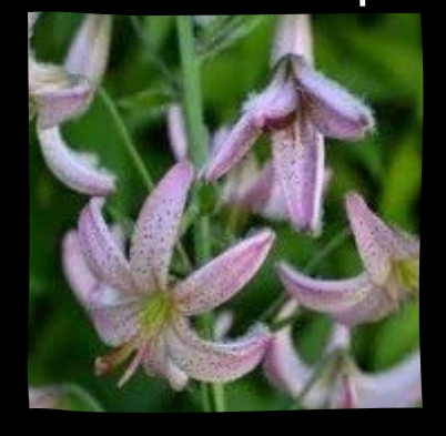
BETHAN EVANS Ht: 3'4' $25