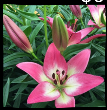
PALENA Ht: 43" $6