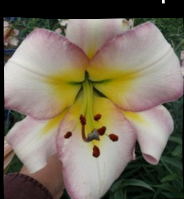
BEIJING MOON Ht: 5'-6' $7