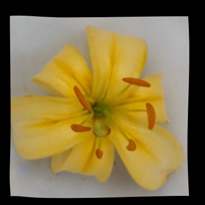
CHERYL BARTLES Ht: 2'-4' $25