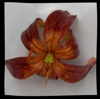
STRAWBERRY FROST Ht: 3' $15