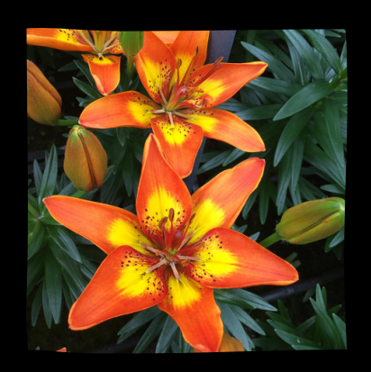
BRIGHT JOY Ht: 16"-18" $6