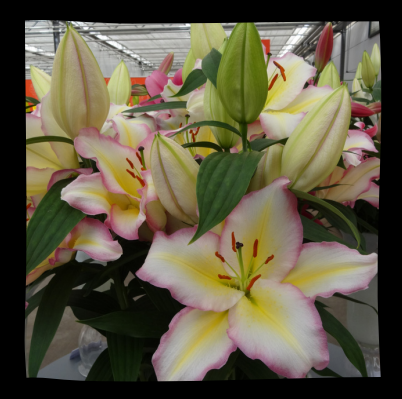
TRICOLOR $7 Ht: 3'-4'