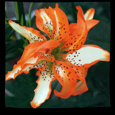
MUST SEE Ht 36"-40" $6