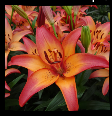
ROYAL SUNSET Ht: 36" $6