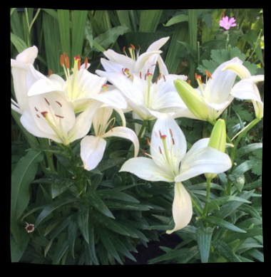
SPARKLING JOY Ht: 16"-18" $6