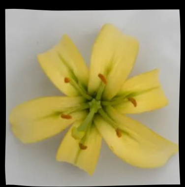
AURWEN EVANS Ht: 2'-4' $20