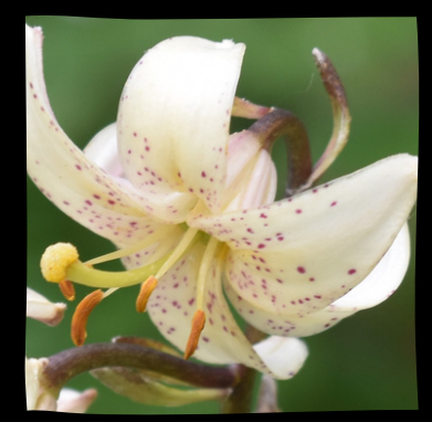
l. MARTAGON VAR. ALBAFLORUM Ht: 3'-4' $30