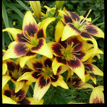
PIETON Ht: 36"-48" $6