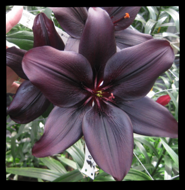
LANDINI Ht 39" $6