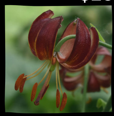
DALHANSONII Ht: 4'-5' $24