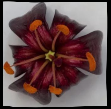
BLACK EDGE Ht: 2'-4" $25