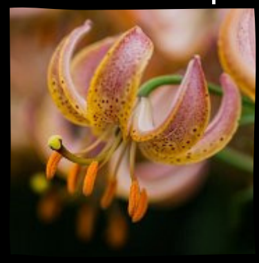
FAIRY MORNING Ht: 2'-4' $24