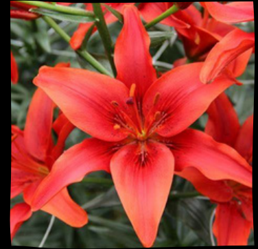
REDHILL Ht: 43" $6