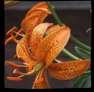
NEPERA Ht: 3' $24