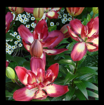
DOUBLE SENSATION Ht: 26" $6