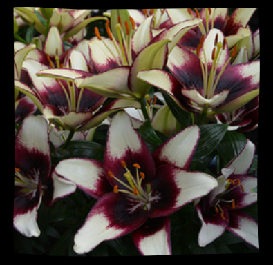
PEPPERMINT JOY Ht: 16"-18" $6