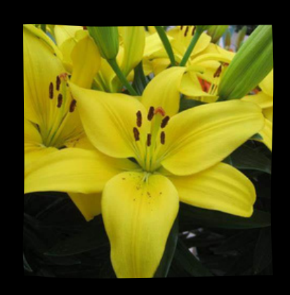
CLASSIC JOY Ht: 16"-18" $6