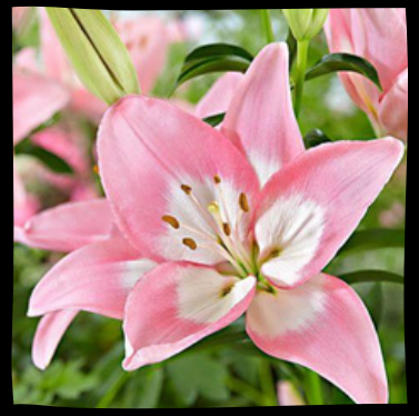
NJOYZ Ht: 35"