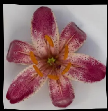
CHERNOVA Ht 3'-4' $25