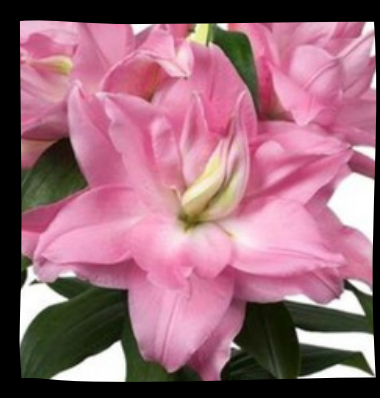
EDITHA Ht: 24'-31" $7