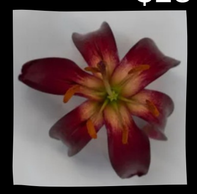
ST ALBERT Ht: 3' $15