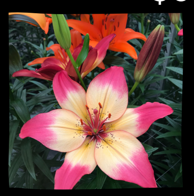
HEARTSTRINGS Ht: 48 $6