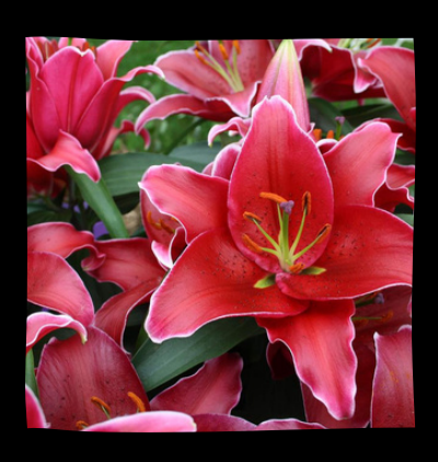
SUNNY KEYS Ht: 16"-20" $7