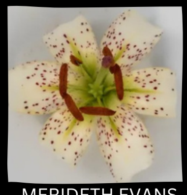
MERIDETH EVANS Ht: 2'-3' $25