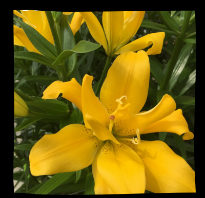
SUNDEW Ht:36"-40" $6