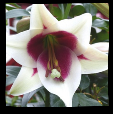
LESLIE WOODRUFF Ht: 5'-6'