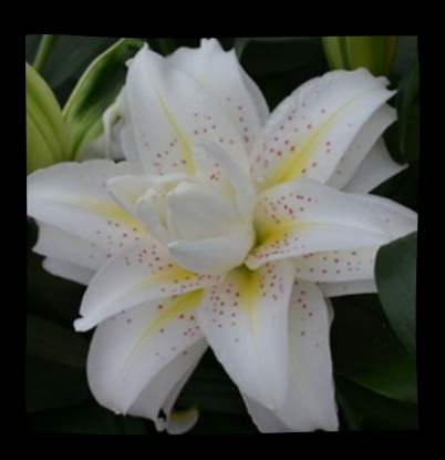
SITA Ht: 36"-40" $7