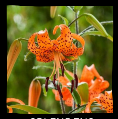
SPLENDENS Ht: 36"-40" $6