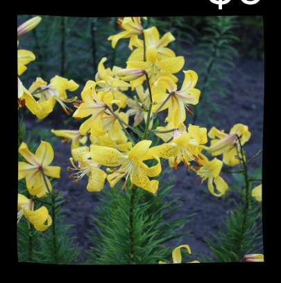
LEMON LADY Ht 2' $6