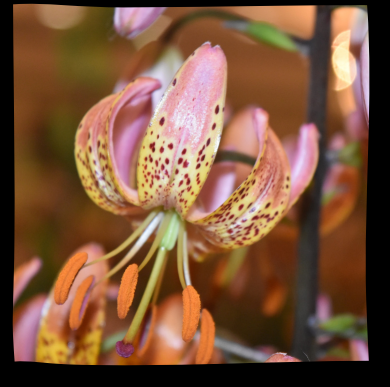
BROCADE Ht: 3'-4' $28