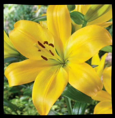
HINAULT Ht: 4' $6