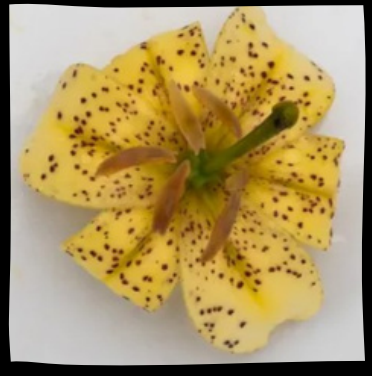
KLONDIKE GOLD Ht: 2'-4' $20