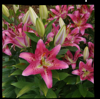
DAPHNE Ht: 2.5'