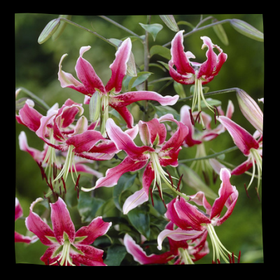
BLACK BEAUTY Ht: 4'-7' $7