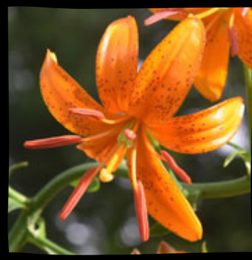
SING OUT Ht: 4'-5' $28