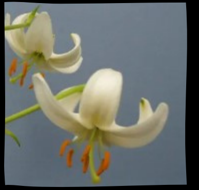
HELEN WRIGHT Ht: 2'-3' $25