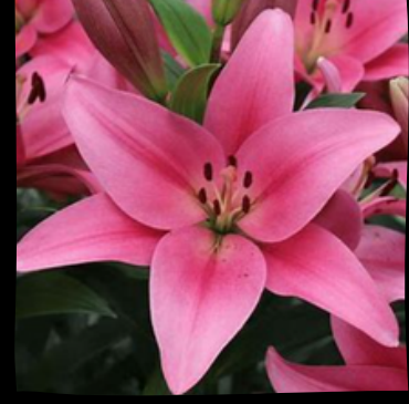
BOARDWALK Ht: 39' $6