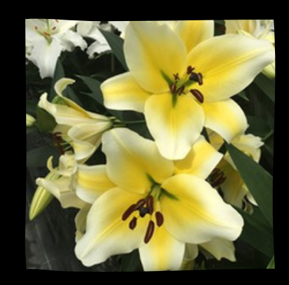
CONCA D'OR Ht" 41" $7