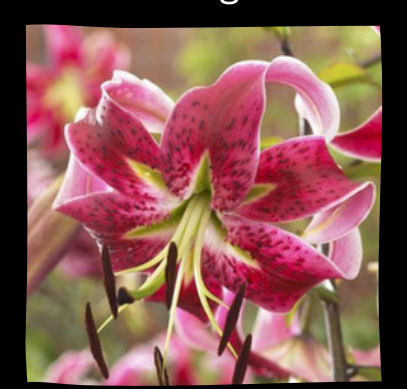
MISS FEYA $7 Ht: 4'