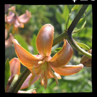
EARLY BIRD Ht: 2'-3' $24