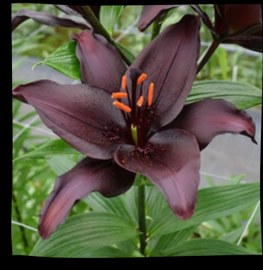
SECRET KISS Ht: 2'-3' $6