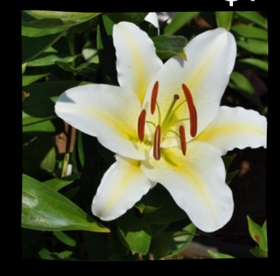
MOON OVER ALASKA Ht: 3'-3.5' $25

NEW 2023 intro! ORIENTAL MAK-LEEK EXCLUSIVES!