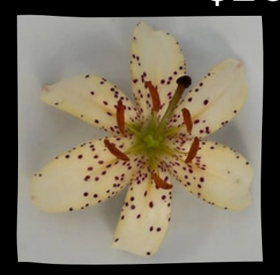
BIG AKI Ht: 2'4' $15