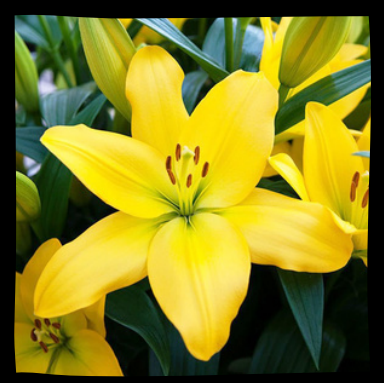
NASHVILLE Ht: 40" $6