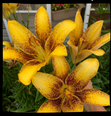
YELLOW BRUSH Ht: 36" $6