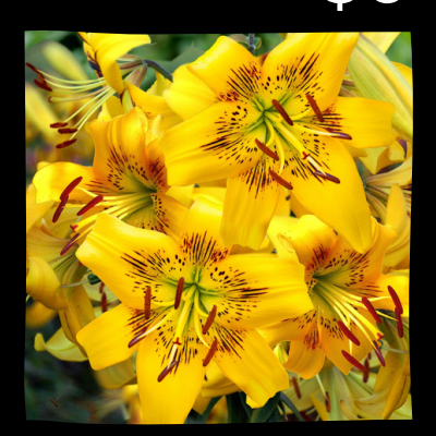
YELLOW BRUSE Ht 3'+ $6