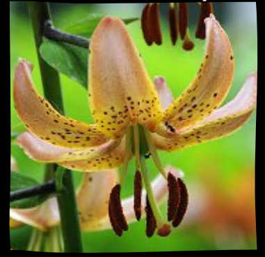
BENDICK Ht: 4' $28