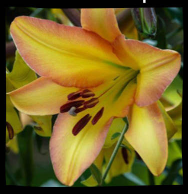
RISING MOON Ht: 5'-6' $7